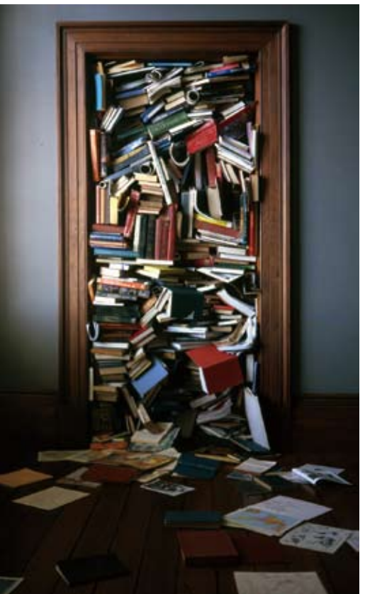
A Reading: 3 , 2008

Image from installation The Library of Forgetting , Elizabeth Bay House Museum, Sydney, Australia, 2007