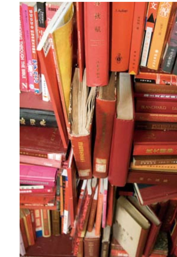
The Book Project , 2009 (detail)

Installation: table and book sculptures, pine and MDF board, size variable Uber Gallery, Melbourne, Australia