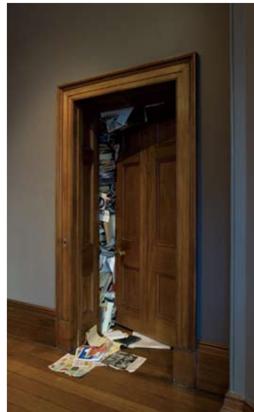
A Reading: 4 , 2008

Image from installation The Reading Room , Elizabeth Bay House Museum, Sydney, Australia, 2007