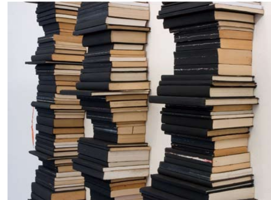
Babel , 2006 (detail) Book towers average 300cm height King Street Gallery on Burton, Sydney, Australia

简·黛尔最近从悉尼移居北京。她的艺术实践作为一种“语言”作品，融合了摄影、装置、雕塑等现成的和手工的元素。个展(有选择的) 2009年图书项目：泼，关渡美术馆，台湾台北；图书项目：泼，首尔国际摄影印刷艺术节焦点艺术家。2008年黑色星期五，台湾台北国际艺术村以及92艺术中心草山国际艺术村；阅览室，墨尔本超级画廊；白色创作，悉尼威廉姆国王街画廊。2007年看图说话，香港岭南大学；阅览室，悉尼作家节，悉尼剧场。2006年口吃，墨尔本超级画廊。2005年灰色空间，大阪这间画廊；海市蜃楼，北京红门画廊；批评的影响，Ivan Dougherty画廊，新南威尔士大学。1996年位置，北京中央美术学院。1995年位置，维多利亚摩宁顿半岛地区画廊。1994年热，皇家墨尔本理工大学教师画廊。群展(有选择的) 2009年再生图书馆，昆士兰澳大利亚巡回展，马凯艺术空间。2008年明亮的黑暗，德国柏林布雷伯特瑞画廊；中国艺术项目启动展，北京平行线空间；宋庄美梦，北京宋庄美术馆。2007/2008年进程一旅行，北京红门画廊，上海东廊画廊，香港中国空间。2007年空房，新南威尔士伊丽莎白白伯湾大屋博物馆；半透明文本，北京红门画廊。2006年艺术交流展，汉城(现名为首尔)弘益大学当代美术馆。2001年巴黎的一个工作室，悉尼SH Ervin画廊。1999年Kunst Rai艺术博览会，阿姆斯特丹。1998/1999年皮肤文化，悉尼大学，香港约翰百德画廊，新加坡LaSalle画廊。1998/1999年相似，汉城(现名为首尔)华克山庄画廊。访问 2009年台北关渡美术馆访问艺术家；2008年台北国际艺术村亚洲联结艺术家；2007年香港岭南大学访问艺术家；1999年/2005年巴黎市访问艺术家；1996年北京访问艺术家；1991年/1992年意大利Verdaccio工作室，莫纳什大学访问艺术家。获奖情况 2008/2009年获得澳大利亚协会创新艺术作品辅助金；2005年澳大利亚联邦艺术/教育贡献展。受委托项目 2009年香港公开艺术项目；墨尔本皇家俱乐部项目。2007年悉尼作家节。出版 广泛的被多家国际媒体报道，共出版20本画册，多家期刊杂志和图书登载。收藏 其作品被澳大利亚和亚洲很多国家的博物馆、大学和私人收藏。资格 1994年获皇家墨尔本理工大学硕士学位；1989年获皇家墨尔本理工大学美术学一等荣誉学士学位。代理 澳大利亚墨尔本超级画廊；澳大利亚悉尼威廉姆国王街画廊。