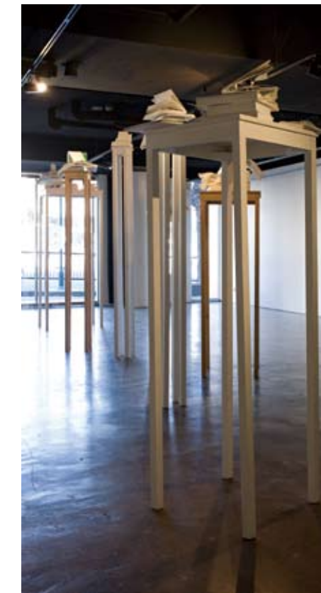
The Reading Room , 2008

Image from installation The Reading Room , Elizabeth Bay House Museum, Sydney, Australia, 2007