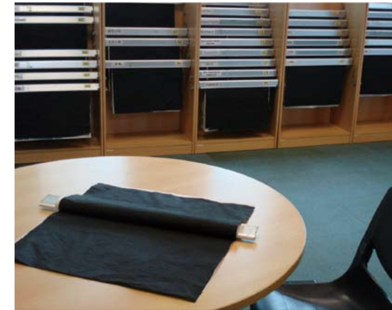
Words for Pictures , 2007 Installation Lingnan University, Hong Kong