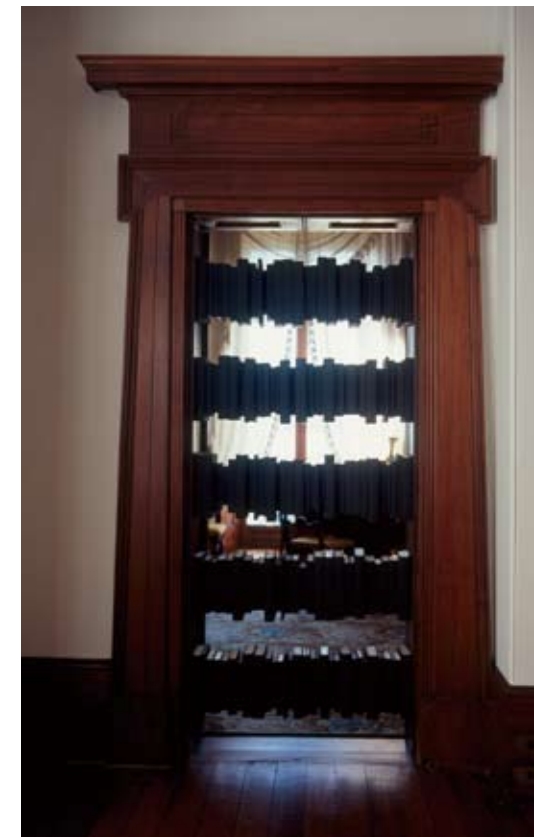
A Reading: 1 , 2007

Digital photograph, 120 x 198cm, Edition of 5