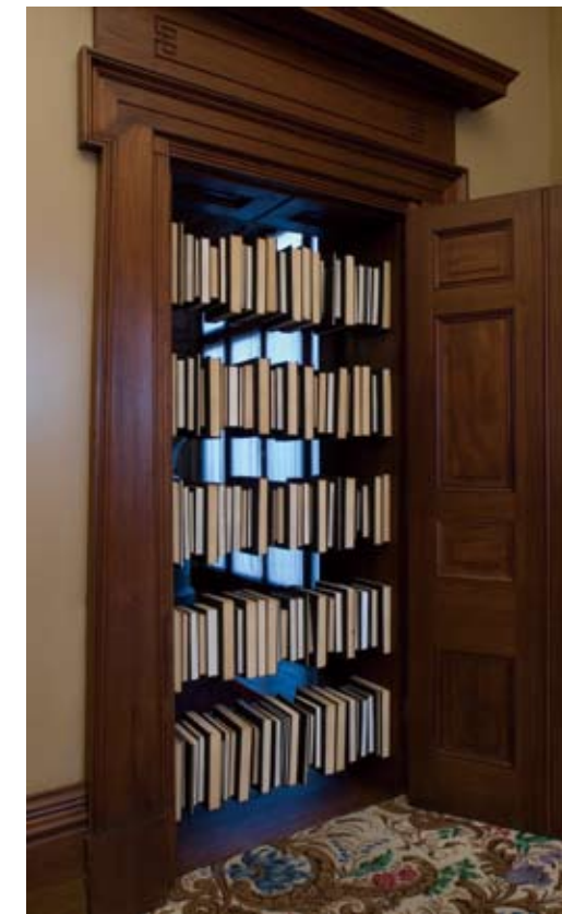
A Reading: 2 , 2007

Image from installation The Library of Forgetting , Elizabeth Bay House Museum, Sydney, Australia, 2007