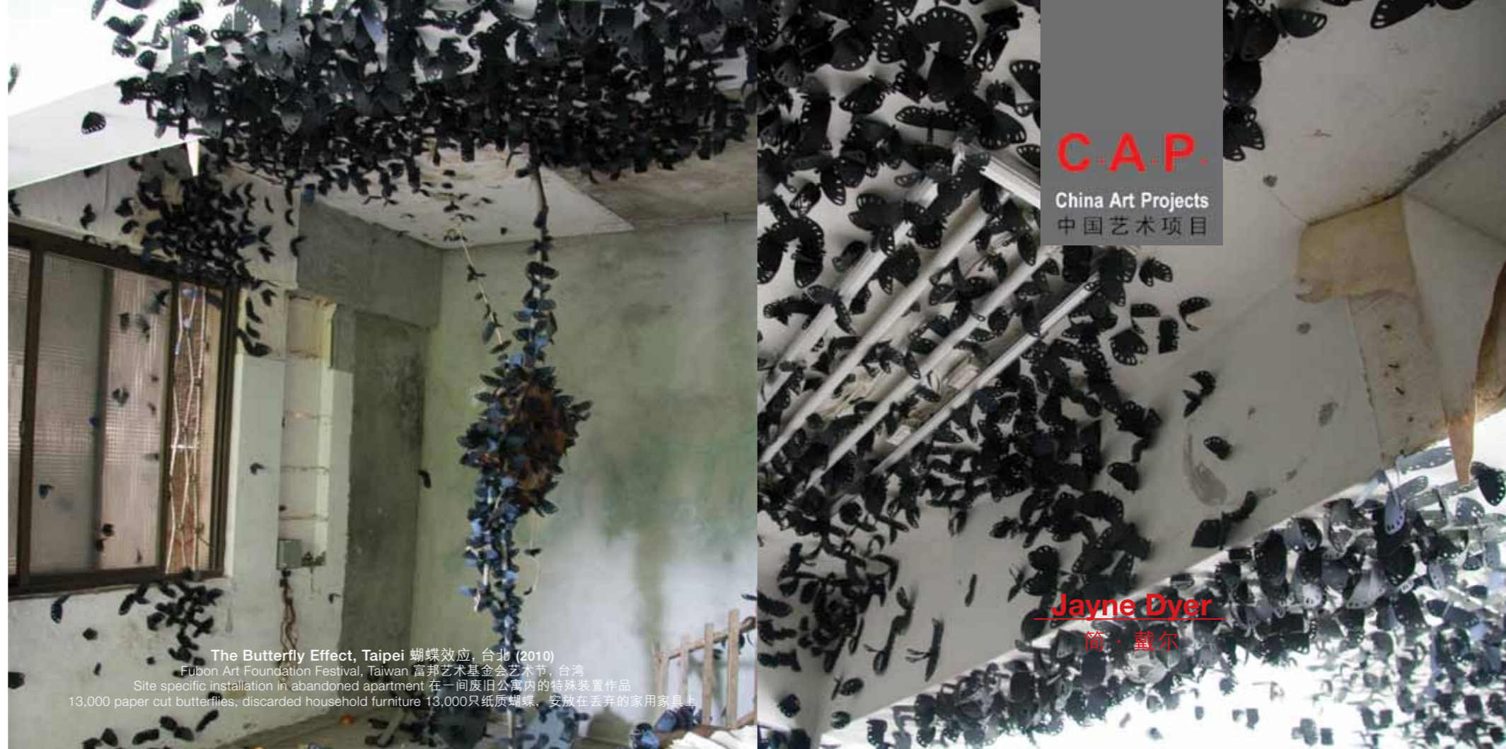
The Butterfly Effect, Taipei 蝴蝶效应, 台北 (2010) Fubon Art Foundation Festival, Taiwan 富邦艺术基金会艺术节, 台湾 Site specific installation in abandoned apartment 在一间废旧公寓内的特殊装置作品 13,000 paper cut butterflies, discarded household furniture 13,000只纸质蝴蝶, 安放在丢弃的家用家具上