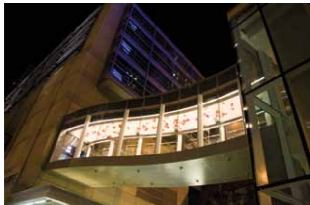
Swire commission 太古酒店委托项目 (2011) City Plaza Link Bridge 城市广场天街 Taikoo Shing 太古城道 Hong Kong Island East 港岛东 100 powder coated steel butterflies 100只钢质彩喷蝴蝶